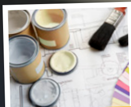
CHOICE OF PAINT COLOURS FOR YOUR HOME

Available at: Horncastle Rise, Pinchbeck Fields & Nettleham Chase