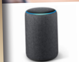
ECHO PLUS 2 - ALEXA