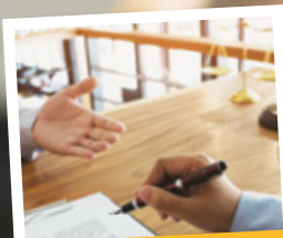
LEGAL FEES PAID