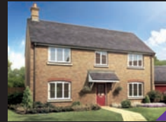
THE SOMERSBY Four bedroom house