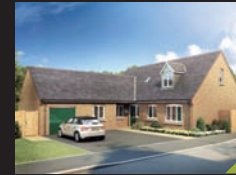
THE FOLKINGHAM Four bedroom chalet bungalow