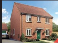
THE KEDDINGTON Four bedroom house