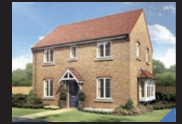
THE NORMANBY Three bedroom house