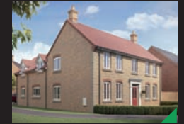
THE WALTHAM Five bedroom house

DESIGNED WITH PASSION. BUILT WITH PRIDE.