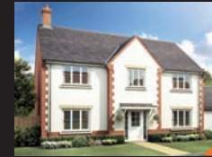
THE BELTON Four bedroom house