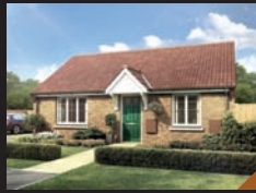
THE KIRTON Two bedroom bungalow

Please see separate information sheets for more details.