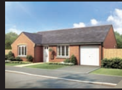
THE MARSTON Two bedroom bungalow