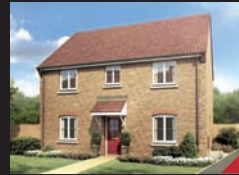
THE ANCASTER Four bedroom house