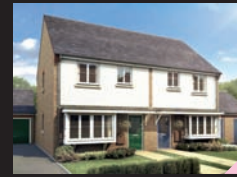
THE WINTHORPE Three bedroom house