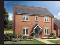
THE LINWOOD Three bedroom house