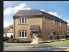
THE NEWTON Three bedroom house