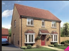
THE REDBOURNE Four bedroom house