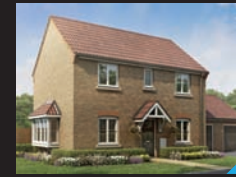
THE MOULTON Three bedroom house