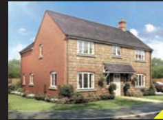
THE RAITHBY Four bedroom house