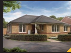
THE FENTON Three bedroom bungalow