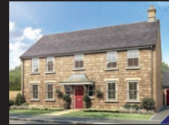
THE EDENHAM Four bedroom house